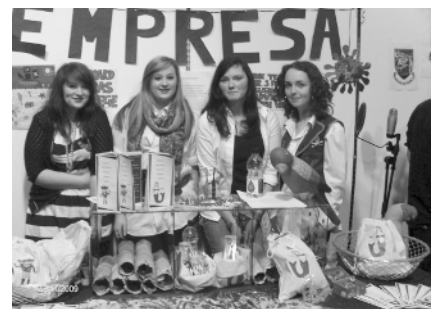
Pupils at the Fife Awards Ceremony