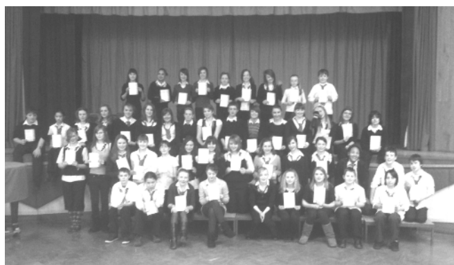
Pupils taking part in the Burns Song Competition