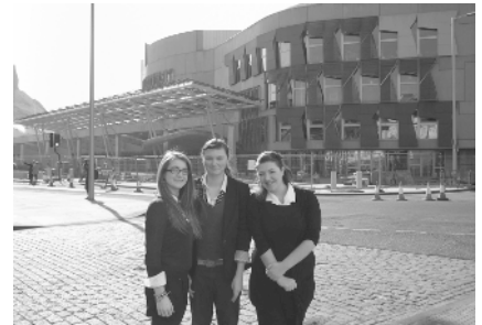
Pupils outside the Scottish Parliament

A small group of pupils from the Young Enterprise company 'Empressa' were invited to visit the Scottish Parliament to meet MSP's and discuss the Young Enterprise Programme. Throughout the year they have produced pirate and mermaid themed kids' teeth cleaning kits, with a waterproof reward chart, funky timer, toothpaste and brush all in a themed bag they designed and manufactured themselves. Good luck to them at the forthcoming Fife finals.