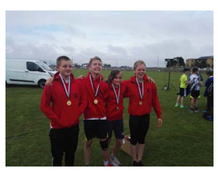
Lawhead Primary School's P7 A Team were the relay winners at Sports Day on Thursday 22nd June.