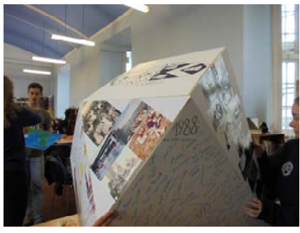
Here's to the next 60 years!