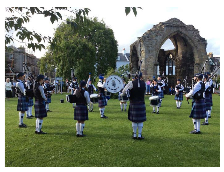
Madras College Pipe Band play on a sunny Saturday evening to welcome guests to the German Kiel Exchange 60th Anniversary Ceilidh

What an achievement! We believe that our German exchange with the Kieler Gelehrtenschule in Kiel, Schleswig-Holstein is the oldest unbroken school-to-school exchange between the two countries. To celebrate this amazing milestone in the history of the exchange, a number of special activities took place during the 60th exchange visit.