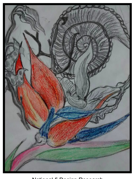
National 5 Design Research

P7s on the transition visits were also awarded stamps for the four Ps, gaining a certificate if they gained six or more stamps; rewarding them for their effort, attitude and behaviour during the visit.